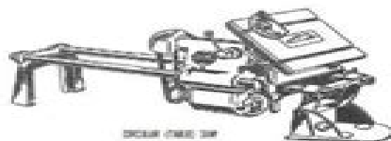
BENCH DRILL PRESS