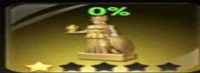
Statue of Athena