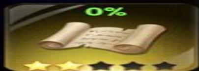
Dead Sea Scrolls