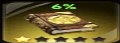
Key of Solomon