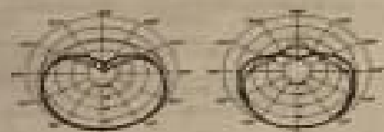
图 3 显示 15.3kHz 峰值

图 2 显示 15.3kHz 峰值，该设备具有低失真度，失真度为 0.1% (见图 3)。