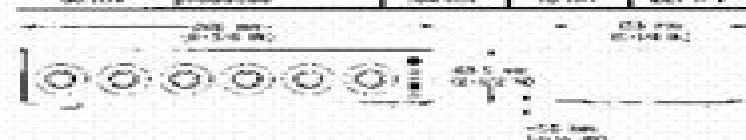
OVERALL DIMENSIONS FIGURE 1