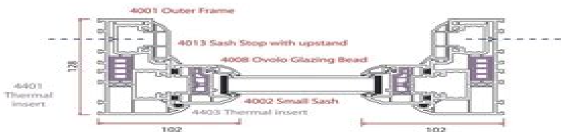
Horizontal section through top sash