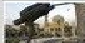
The student is holding the large umbrella.

Students will be able to identify the main idea of a text and support it with evidence from the text.