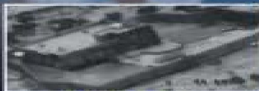
SUPPORTING SPECIAL FORCES