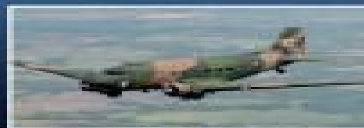
AC-47 THE FIRST GUNSHIP