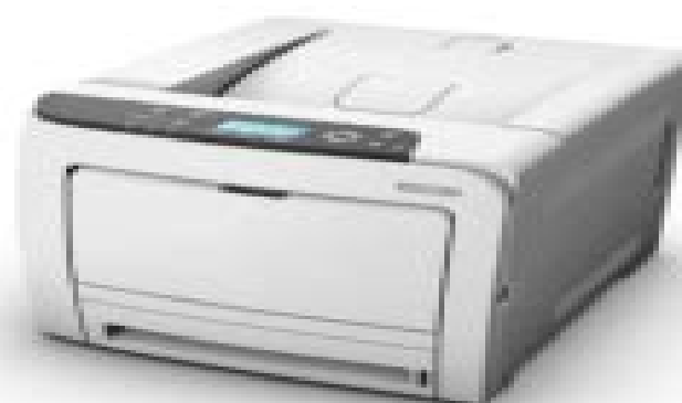
Aficio SP C320os