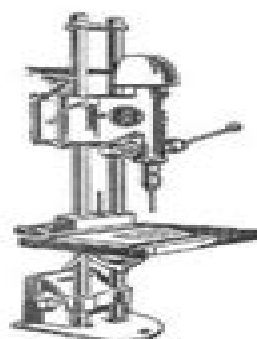
VERTICAL DRILL PRESS