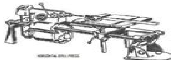
HORIZONTAL DRILL PRESS