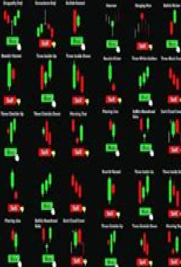
CHART PATTERNS CHEAT SHEET