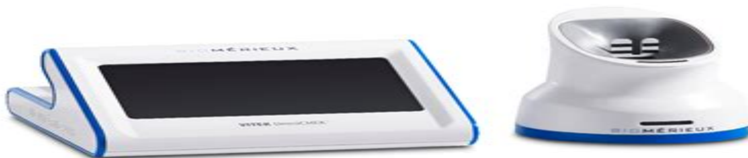
Figure 14: Display Base and Pod Overview