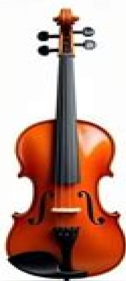
Afibed he justed $29.90