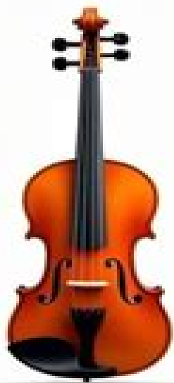
Bet urf mme? $44.95