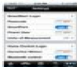
Settings-Mode 1 & 2