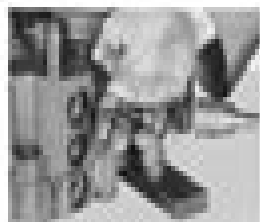
WIRING The power supply unit is shown in the photo. The power supply unit is shown in the photo.