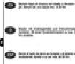
WIRING The power supply unit is shown in the photo. The power supply unit is shown in the photo.