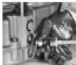
WIRING The power supply unit is shown in the photo. The power supply unit is shown in the photo.