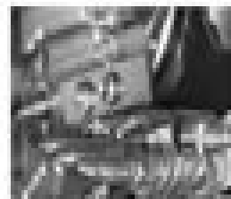
WIRING The power supply unit is shown in the photo. The power supply unit is shown in the photo.