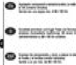
WIRING The power supply unit is shown in the photo. The power supply unit is shown in the photo.