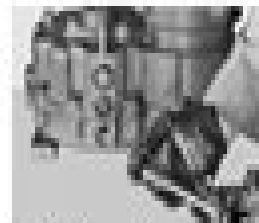
WIRING The power supply unit is shown in the photo. The power supply unit is shown in the photo.