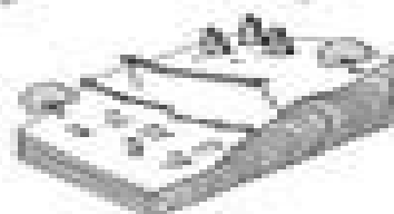
Gradual downhill movement of soil

9. The diagrams below represent four different examples of one process that transports sediments.