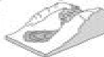
Downslope flow of fine particles (mud) and large amounts of water