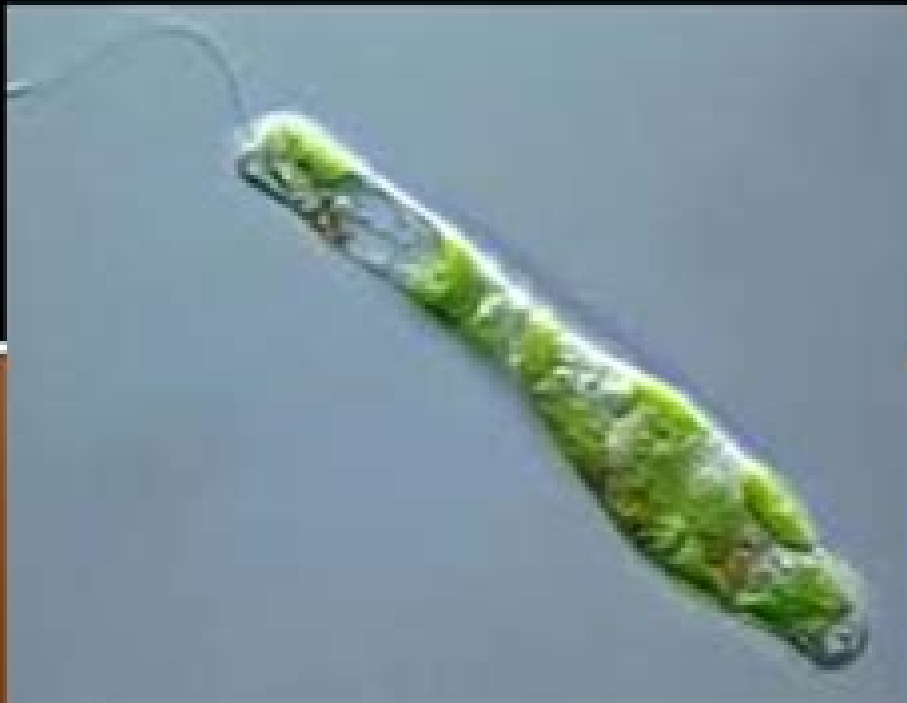
Structure of the Euglena