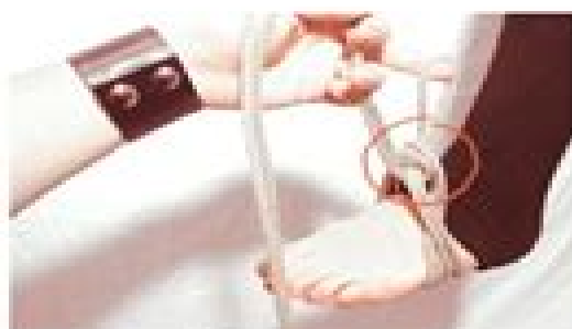
Step 4: tie an over-hand knot through all coils, as shown