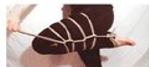
Step 10: reverse again, this time going over the thigh