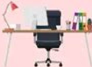
Desks & Chairs