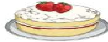
baking a cake