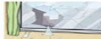
breaking a window