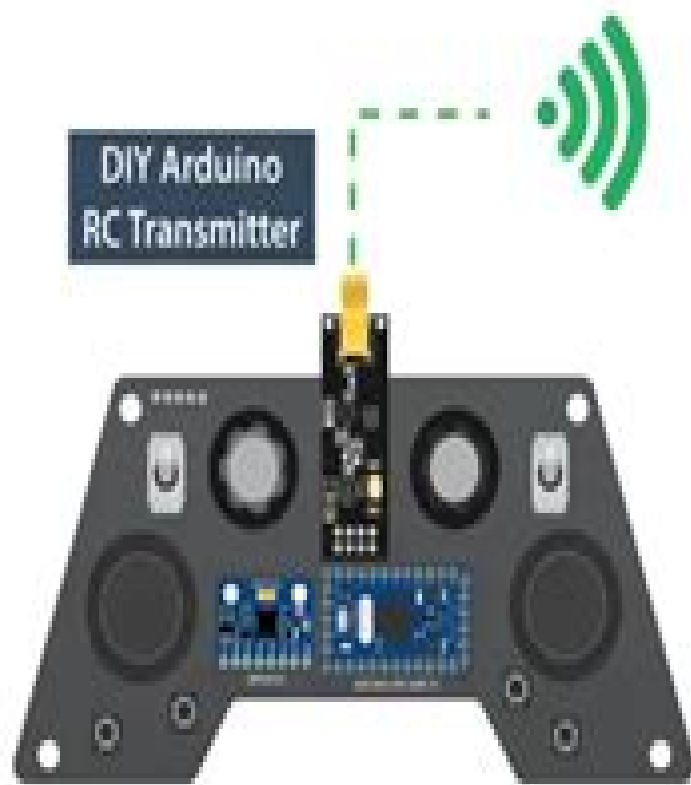
DIY Arduino RC Transmitter