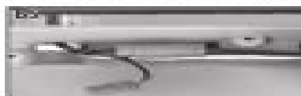
FIG. 2 CHASSIS WIRING