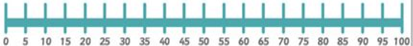
Counting in 5s number line