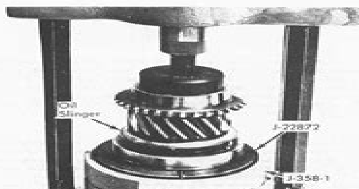
Fig. 7 Installing Drive Gear Bearing

Cleaning & Inspection — 1) Wash all parts in clean solvent and inspect mainshaft for scoring or wear at thrust surfaces and splines. Check synchronizer hub and sleeve for excessive wear. Sleeve should slide freely on synchronizer hub. Check fit