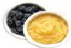
2 Cups Fruit