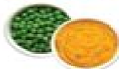
2 1/2 Cups Vegetables