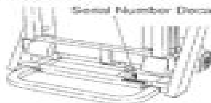
Serial Number Decal

Write the serial number in the space above for future reference.