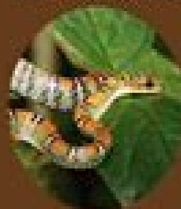
Twin-Barred Tree Snake

From walking fish to flying snakes! The Twin-barred Tree Snake can glide between forest trees by flattening out its body into an aerofoil!