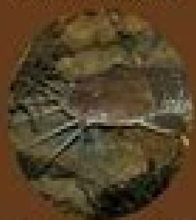
Forest Walking Catfish

One of the many native freshwater fish species in Singapore, this fish has the bizarre ability to walk on land!