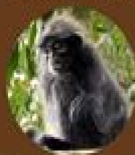
Banded Leaf Monkey

Enigmatic and reclusive, the Banded Leaf Monkey lives deep in our forests and is highly endangered, with only 40-60 left in the wild.