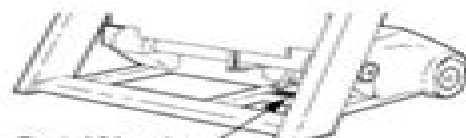
Serial Number Decal