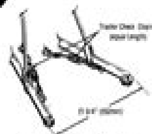
Figure 3 Tractor Check Chains