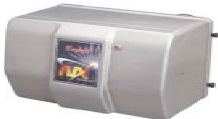
NX Burner Cover