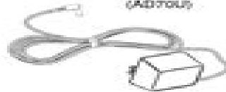
AC Adapter (AD70L)