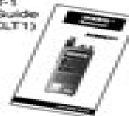
BC60XLT-1 Operating Guide (OMBC60XLT1)