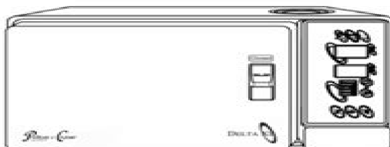
Model AE (8")

USER MANUAL GEBRAUCHSANWEISUNG NOTICE D'UTILISATION INSTRUCCIONES DE USO