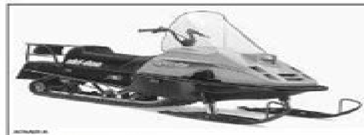
TYPICAL — TUNDRA R

Skandic LT Skandic WT Skandic SWT Skandic WT LC