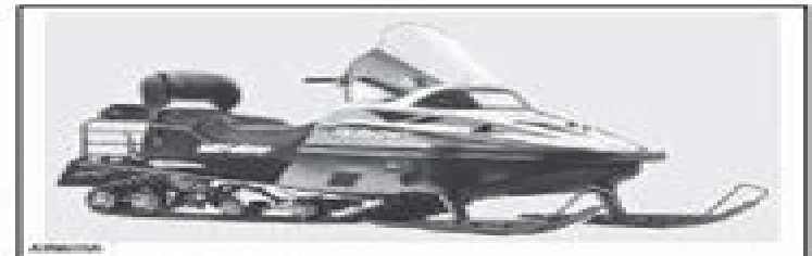
TYPICAL — SKANDIC SERIES