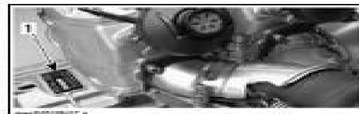
TYPICAL — 600 HO E-TEC 1. Engine serial number