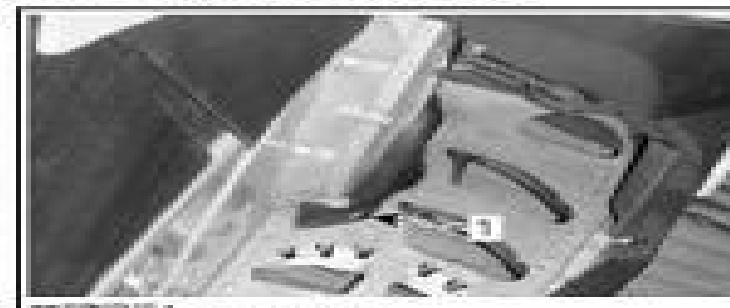
1. Reinforced Holes in Footrest

To lift the snowmobile securely, it is important to use the reinforced footrest holes.