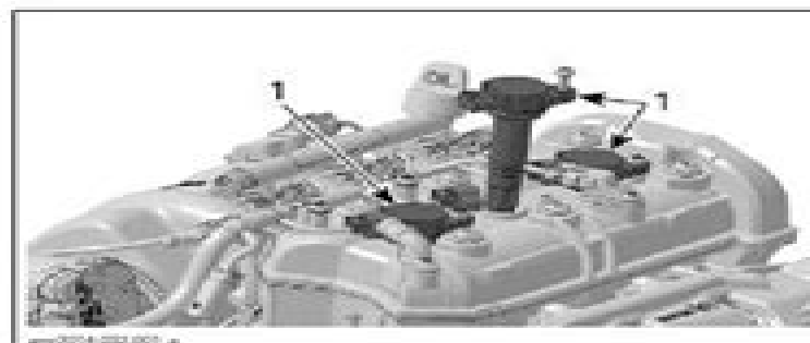
1. Ignition coils

Three direct ignition coils receive power from the fuse F3 through the relay.