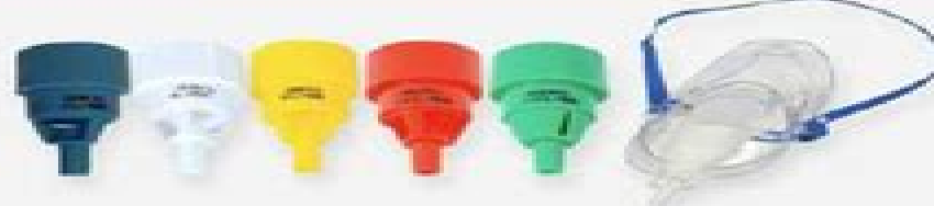
Venturi Valves and Mask