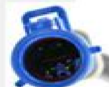
4 Pin Round Plug

Suits Falcon BA BF MY02 - MY2010 Suits Falcon FG MY08 - MY14 (incl MK2) Suits Falcon FG X & XR Sprint Suits Territory SX SY, SYII MY04 - MY11 Suits Territory SZ / SZ MK2 MY11- On