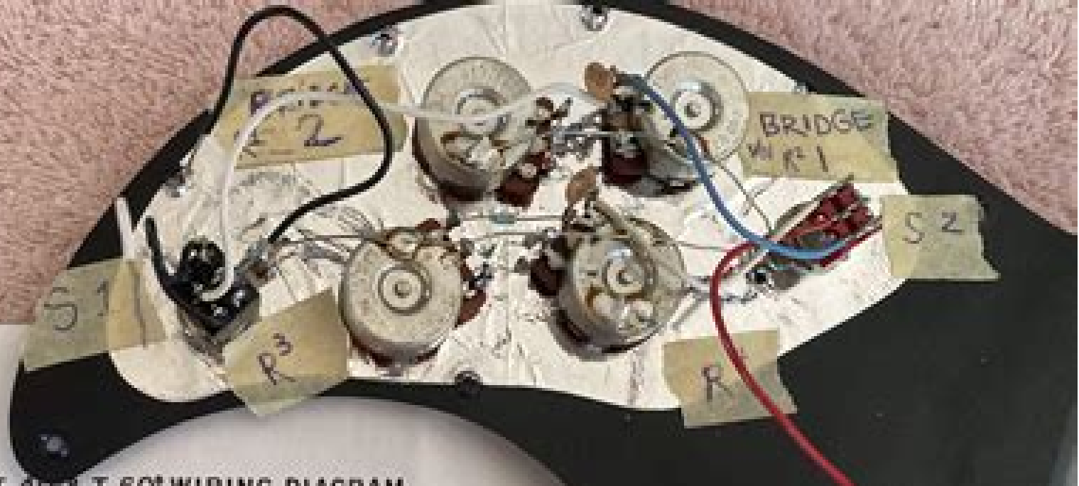
T-40 & T-60 ® WIRING DIAGRAM REAR VIEW