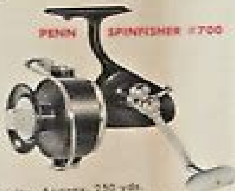
PENN SPINFISHER #700

Ideal line capacity—Approx. 250 yds. of 20 lb. Mono-Fast Gear Ratio—2.8 to 1. Has 2 speeds, each with complete drag systems. Left hand drive. Full ball. Manual conversion kit available.