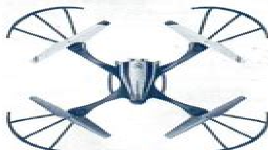
RC Video Drone