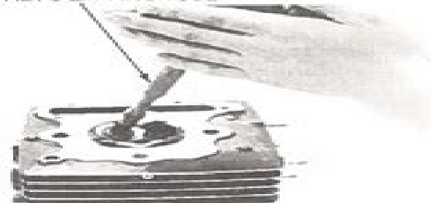
(1) VALVE LAPPING TOOL

Take care not to allow the compound to enter between the valve stem and guide.