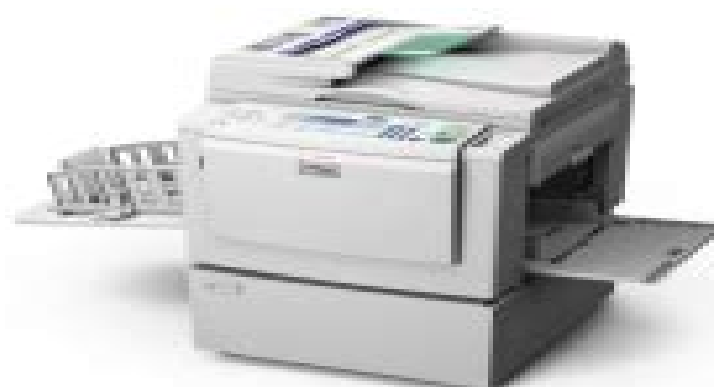
Preprint™ DX 3243/DX 3443