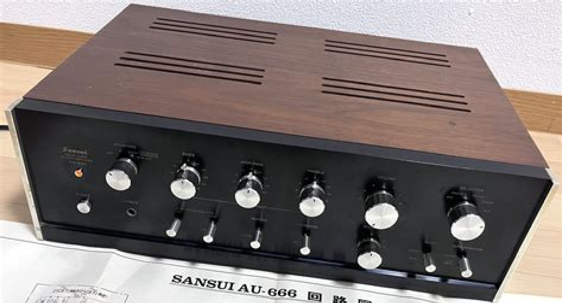
SANSUI AU-666 回路図