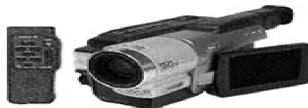
Photo : CCD-TRV98E

US Model CCD-TR618/TRV49/TRV58/TRV68/TRV78 Canadian Model CCD-TR618/TRV49/TRV58/TRV68 AEP Model CCD-TR618/TRV49/TRV58/TRV68 UK Model CCD-TR618/TRV49/TRV58/TRV68 E Model CCD-TR618/TRV49/TRV58/TRV68/TRV78/TRV78E/TRV88/TRV98 Australian Model CCD-TR618/TRV49/TRV58/TRV68/TRV78 Hong Kong Model CCD-TR618/TRV49/TRV58/TRV68/TRV78 Tourist Model CCD-TR618/TRV49/TRV58/TRV68/TRV78 Chinese Model CCD-TR618/TRV49/TRV58/TRV68 Brazilian Model CCD-TR618/TRV49/TRV58/TRV68 Argentina Model CCD-TR618/TRV49/TRV58/TRV68 Korea Model CCD-TR618/TRV49/TRV58/TRV68