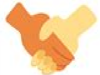
Negotiation and Conflict Resolution