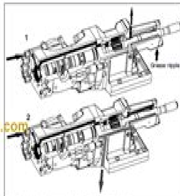
Fig. 2. Lubrication scheme: 1. Surface model; 2. L&amp;D model

The rock drill percussion mechanism and the rotation motor are lubricated by the hydraulic oil flowing through them.