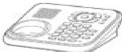
KX-TG9341S/T (Base Unit)