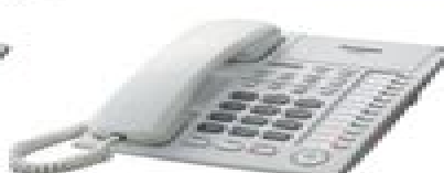
■ KX-T7750 Monitor Unit