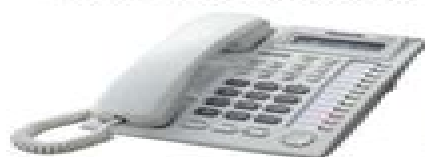
■ KX-T7730 LCD, Speakerphone Unit