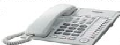
■ KX-T7720 Speakerphone Unit