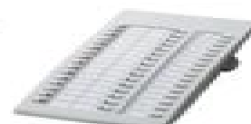
■ KX-T7740 DSS-Console