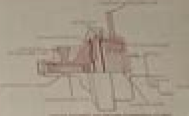
Figure 1: Pinto Performance Engine

ENGINE IDENTIFICATION The Pinto Performance engine is a 1.6L, 4-cylinder, carburetor-fed engine. It is identified by the following features: