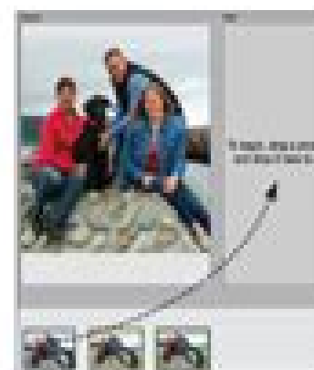
FIGURE 16-43 Drag the photo you want to use as a base into the Final pane. In this case, the expressions of the man and the girl look best in the first image, so I'm building on that one.