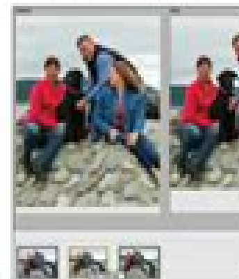
FIGURE 16-45 The second image includes the woman's best smile, so I clicked it in the Photo Bin to load it into the Source pane at left. Colored handles help you track which photo is which.