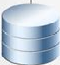
Database with Schemas